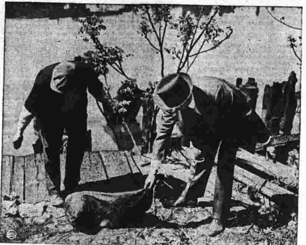
Cleveland, Ohio—Police of this city, puzzled since 1934, as to the identity of Cleveland's mad torsio murderer, had further problems to solve when bridge tenders on the murky Cuyahoga river, dragged the water five portions of a woman's body. Officials were undecided whether a high, a woman's body, or whether they were portions of the body of the eleventh victim, whose train pulled down with a hurried tag which, when taken from the water, contained the complete trunk of the woman's body.